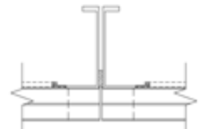
Invisible Vertical Mullion