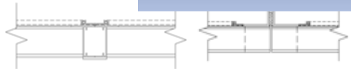
Visible Vertical Mullion