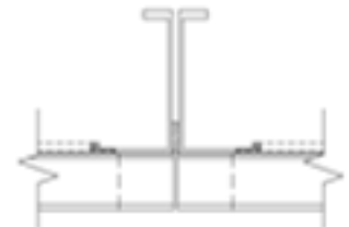
Invisible Vertical Mullion